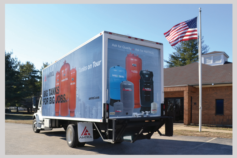
Tanks on Tour™ in front of the Amtrol Education Center.

All models are Amtrol Rewards<sup>™</sup> eligible. Visit amtrolrewards.com