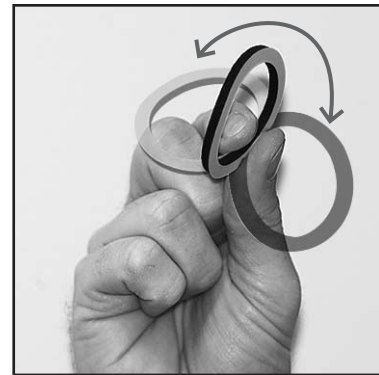
Roll gasket between thumb and index finger to remove backing paper.