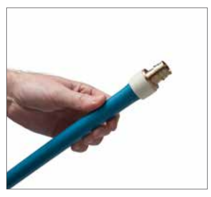
5. The installation is complete with a visibly secure connection.