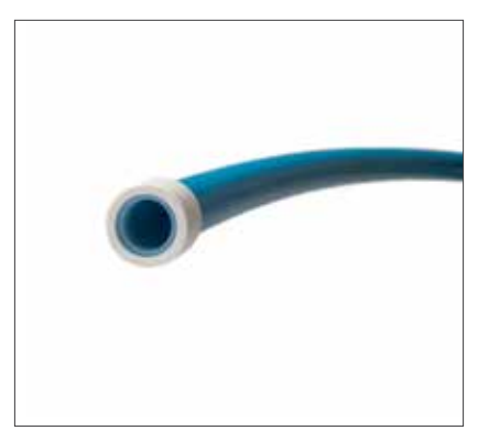
2. Slide F1960 ring onto pipe to the stop within the ring.