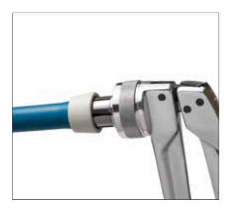
3. Using pipe expander, expand ring fully. Repeat expansions, rotating expander 1/8-turn between expansions.