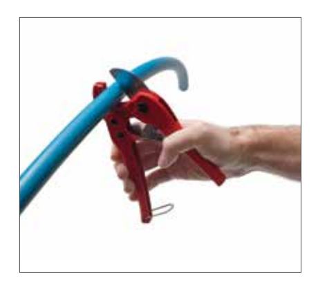
1. Square cut PEX pipe 90 degrees to pipe length.