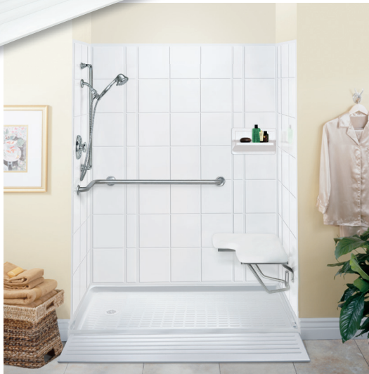
360 CareGiver® Barrier-Free shower floor shown with various optional companion products. See reverse side.

Whether you are designing for a hospital, assisted living facility, or home, the solution is the same...the Model 360 CareGiver® Barrier-Free shower floor from E.L. Mustee & Sons, Inc., the market leader. The Model 360 Barrier-Free shower floor has a color-matched, slip-resistant 60" x 12" entry ramp (order separately) which features a gentle slope to create a totally curbless shower entrance.