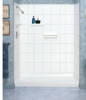
572T VARISTONE® – Fiberglass Shower Walls – Deluxe 5-piece wall system with an embossed tile pattern on all panels. Adhesive mounts to drywall or like surfaces. 572TWHT - White 572TBN - Bone