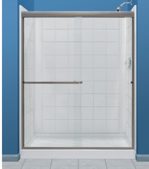
760T-30WHT DURAWALL® Fiberglass Shower Walls – 5-piece wall system with an embossed tile pattern on back & side panels. Mounts direct-to-studs. 760T-30WHT - White