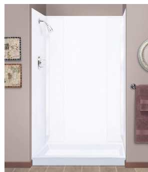
265 DURAWALL® Thermoplastic Shower Walls – 5-piece wall system with smooth walls. Adhesive mounts to drywall or like surfaces. 265WHT - White