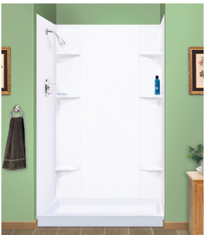
260 DURAWALL® Thermoplastic Shower Walls – 5-piece, wall system with four integral shelves. Adhesive mounts to drywall or like surfaces. 260WHT - White 260BN - Bone