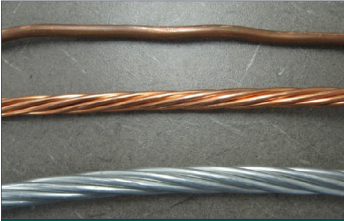
Example of Bonding Conductor

The bonding conductor can be a solid or stranded copper or aluminum conductor. The conductor can be installed indoors or outdoors.