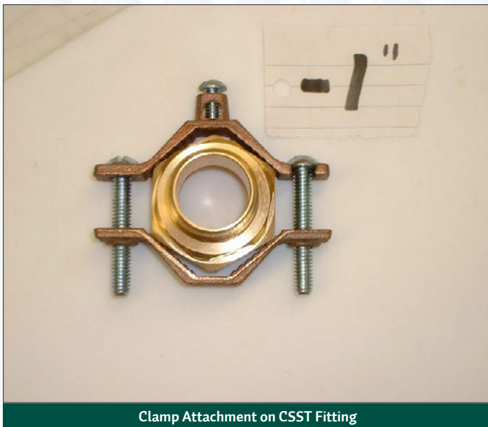
Clamp Attachment on CSST Fitting

Where the clamp is attached to rigid pipe, the pipe surface must be clean and free of paint and coatings to permit a metal-to-metal connection.