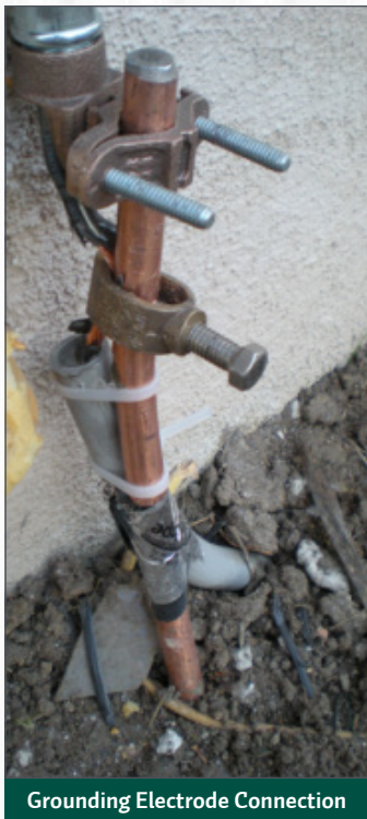
Grounding Electrode Connection

The means for attaching the bonding conductor to the grounding electrode system must be in accordance with NFPA 70.