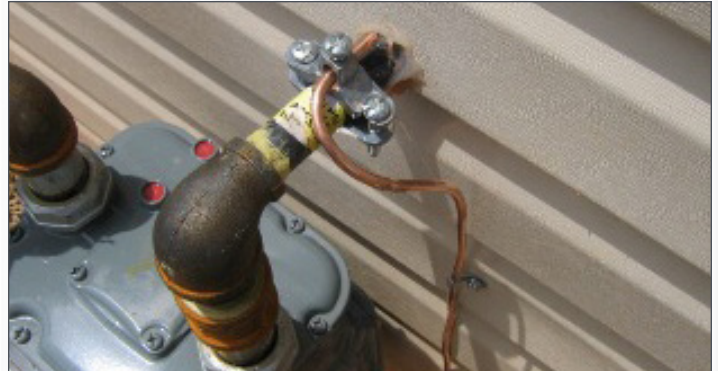
Bonding at the Service Entrance

The bonding conductor must be attached to the CSST gas piping system downstream of the point of delivery (either the natural gas meter or the LP 2nd stage regulator). The bonding clamp can be located at any location within the piping system. In general, the shortest bonding conductor will be the most effective.