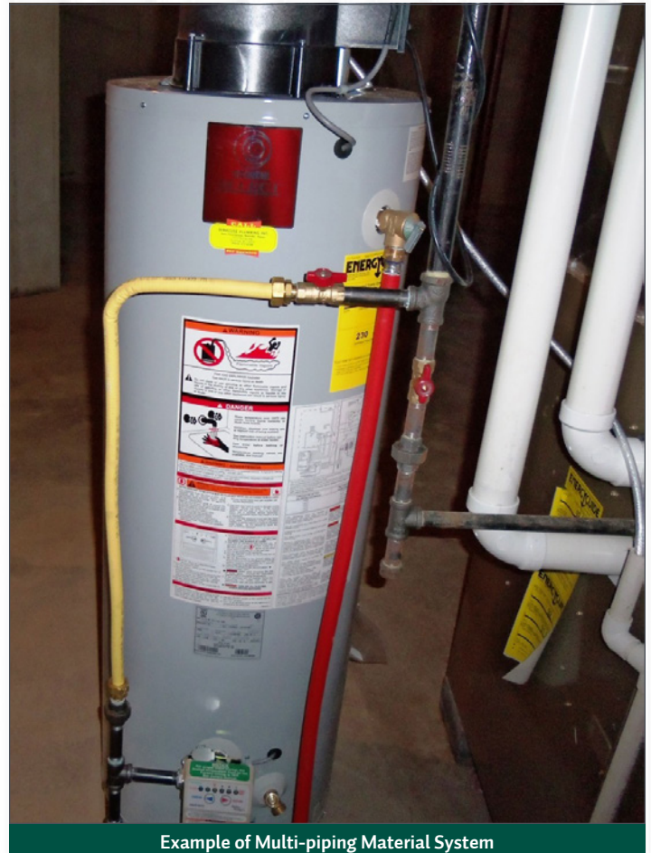
Example of Multi-piping Material System

All new CSST systems must be bonded regardless of whether the systems include only CSST or include other piping materials (steel pipe or copper pipe/tubing) in combination with CSST. Existing non-CSST piping systems must be bonded when CSST is added to the system regardless of the length of CSST added.