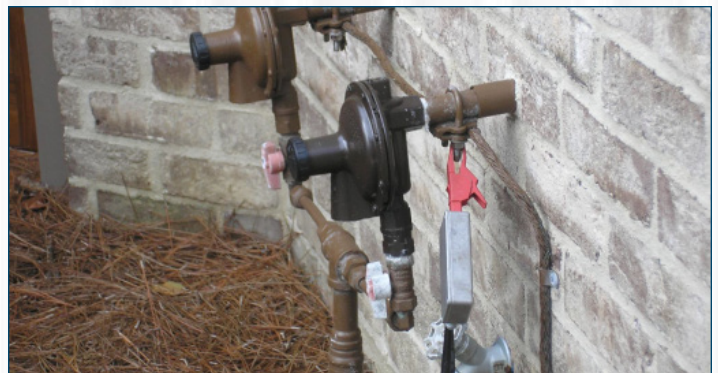
Bonding at the Downstream LP 2nd Stage Regulator

The corrugated stainless steel tubing must never be used as a point of attachment of the bonding clamp.