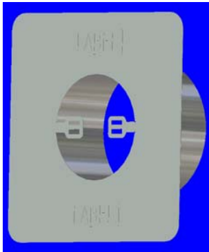
Inside Wall Plate with Tabs & Collar